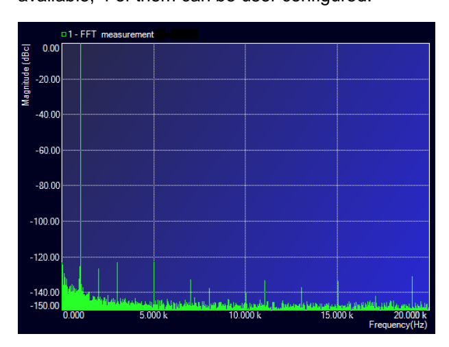
DC to 20kHz spectrum, 1KHz carrier, 1.2kHz filter-on

The module features differential outputs with a programmable common-mode voltage. For single ended applications the positive output as well as the negative output can be used. There are 8 filter paths available, 4 of them can be user configured.